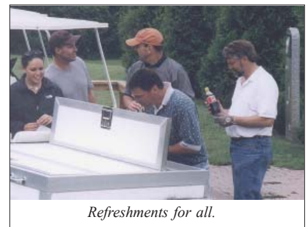
Refreshments for all.